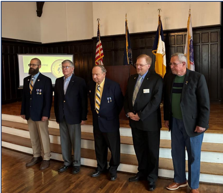
2026 Harris Ferry Chapter SAR Officers