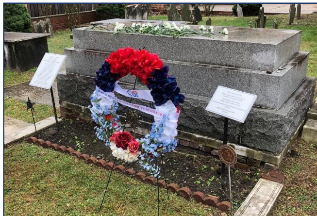
John Barry SAR Patriot #: P-109878 Commodore of the U.S. Navy