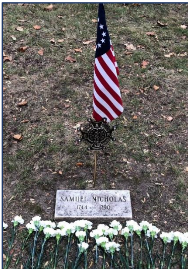
Samuel Nicholas SAR Patriot #: P-256119 Commandant of the U.S. Marines