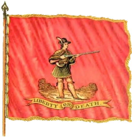
Flag of Hanover Associators 1775