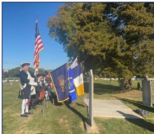
Grave Marker (left); Presentation of Colors (above)