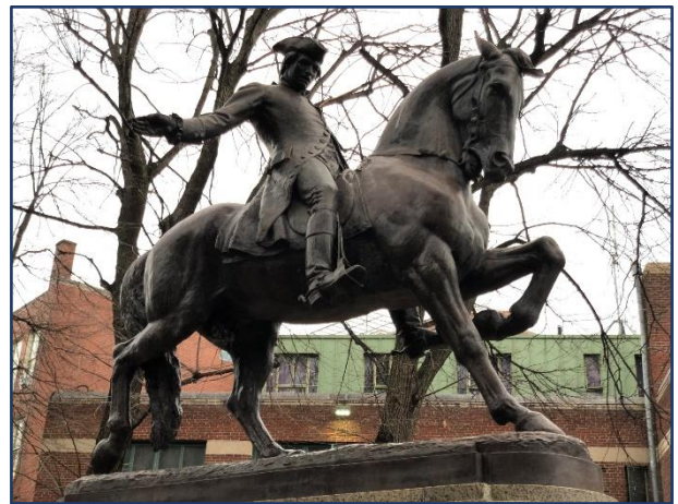
Paul Revere statue in front of Old North Church, sculpted by Cyrus E. Dallin