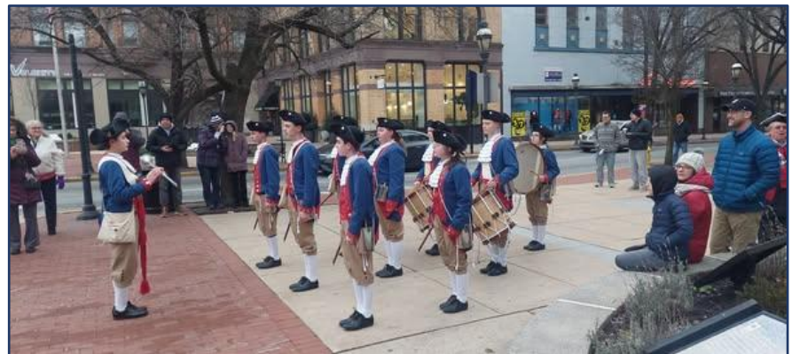
The Central York Middle School Fife and Drums