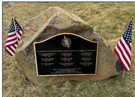
New DAR Patriot Grave Marker at Wenrich's Cemetery