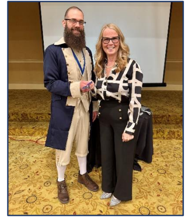
"The Passing of the Fork"