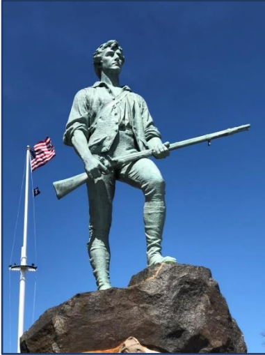
Captain John Parker statue at Lexington Green, sculpted by Henry Hudson Kitson

In celebration of the 250th Anniversary of the Battles of Lexington and Concord, the National and Massachusetts Societies hosted a large multi-day event that was an absolute success and well-attended by many.