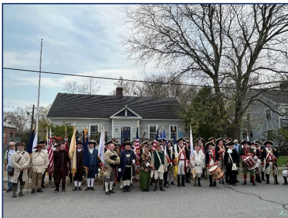
Concord 2025 Patriots' Day Parade SAR Attendees