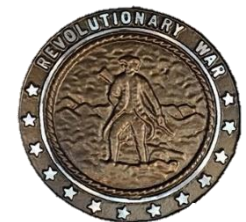
Revolutionary War Grave Marker

The Evening News , Harrisburg, PA, May 6, 1963, p. 17.